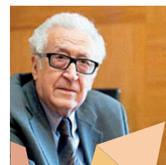
Former Joint Special Representative of the UN and the Arab League in Syria, former UN Special Envoy in Iraq, former UN Special Representative in Afghanistan

Due to his impressive credentials in the name of peace, he became a member of The Elders, a group of prominent world leaders working for global peace in 2007. Of course, these very same credentials also made him an honourable member of the UCLG City of Bogotá Peace Prize Jury.