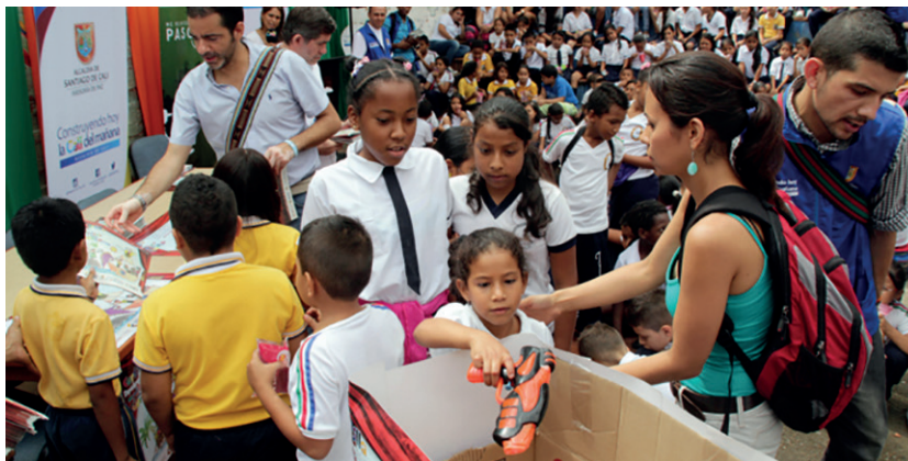
War toys are traded for the ‘Disarm and Think About this Story’ booklet

As the third largest city of Colombia, Cali receives many internally displaced persons (IDPs) that flee the countryside as a result of ongoing violent conflict. These victims of war consist of both civilians and demobilized combatants. Regardless of their role, however, they are likely to have suffered traumatic experiences, which can cause them to have difficulty in integrating in a new environment. A special peace advisory body of the Cali government aims to prevent this through three integrated projects.