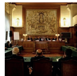
World Conference on City Diplomacy, the Hague, 2008

The new world organisation brought various strong networks promoting local governments as actors for peace together. The Italian Co-ordination of Local Authorities for Peace and Human Rights, the Province and City of Barcelona, United Towns Organisation France, the Canadian Association of Municipalities (FCM) and my VNG joined hands to raise the attention for this city diplomacy role of local governments. It led to preparatory conferences in Perugia and Barcelona in 2006 and 2007. With strong support of VNG and in cooperation with IKV/Pax Christi and the Global Partnership for the Prevention of Armed Conflict we succeeded to organise the first World Conference on City Diplomacy of UCLG in The Hague, June 2008. This successful and impressive congress with several representatives of local governments from war-torn countries like Bosnia-Herzegovina, Colombia, Liberia, Rwanda, Israel and Palestine resulted in 'The Hague Agenda on City Diplomacy', a document with concrete suggestions for further action. Amongst the different suggestions for further action in The Hague Agenda the idea of a World Peace Prize for local governments was mentioned.