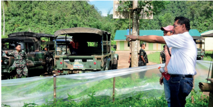
A former MILF commander with a project manager

In the midst of a longstanding conflict, the local authorities of Kauswagan, in the Lanao del Norte province of the Philippines, showed courage and innovation by coming up with a comprehensive localized reintegration programme called 'From Arms to Farms'. Even though it was the central government that ultimately convinced the Islamic secessionist rebels into laying down arms, there is no doubt that the programme has been a great peace contributor.