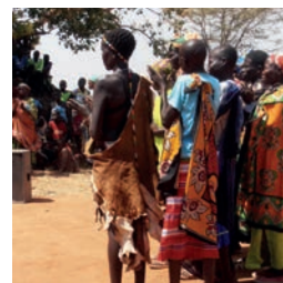
Community Peace Dialogue in Lotome, Uganda

Local governments logically have a central focus on the well-being of citizens, or in other words: a focus on human security. The principle of the human security is officially adopted by the United Nations, and it builds upon the fundamental human right that we call the 'freedom from fear'. It relates to the principles of the responsibility to protect (R2P) and the protection of civilians (PoC). Local governments embarking in peace initiatives in times of war and violence do nothing less than uphold the principles of fundamental human rights and international humanitarian law, that we have internationally agreed upon.