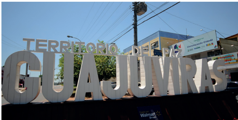
The Peace Territory sign in Guajuviras

D ue to its very high crime rates – 70 homicides per 100,000 inhabitants – the Guajuviras district in the city of Canoas had become known as the ‘Brazilian Baghdad’. In 2009, public authorities and the police forces launched an extensive initiative in order to achieve a permanent reduction of violence. With the creation of a so-called ‘Peace Territory’ the programme achieved a 34% reduction in the number of violent deaths in the Guajuviras district during the first year. The participatory and social nature of the initiative as well as its replicability, contributed to the selection of Canoas as a finalist for the UCLG City of Bogotá Peace Prize.