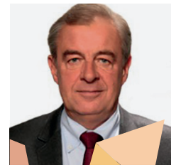
Former Mayor of Sarajevo