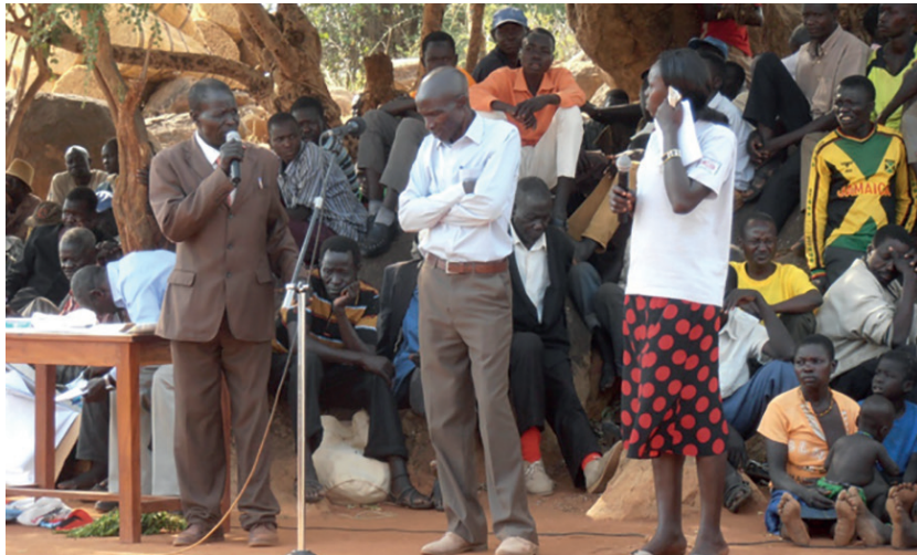
A Community Peace Dialogue supported by PAX for Peace

Why does PAX, as a peace organization active in many conflict and post-conflict countries, support a peace prize for local governments? Well, we have been working with local governments for more than 35 years now, and to us it is clear that local governments have a huge potential for peacebuilding. That is largely due to the fact that they are closest to the citizens and have good opportunities to co-operate with citizens and civil society initiatives.