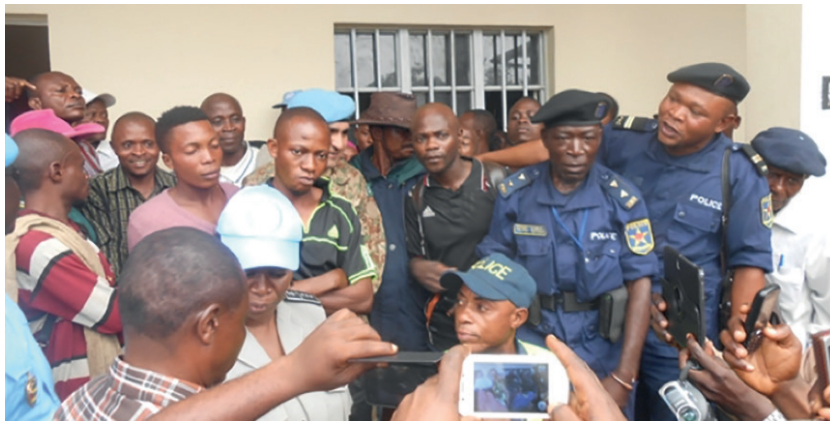
The FARDC and local Raia Mutomboki forces reconcile

The province of South Kivu, which borders Rwanda and Burundi, has been the stage of armed conflict for many years. In the absence of the DRC armed forces (FARDC), parts of the population mobilized to form a self-defense force called Raia Mutomboki, after remnants of the Interahamwe forces, who were involved in the genocide in Rwanda, moved into the region. However, one problem was substituted by the other, since no one could now control the self-defense force. In 2013, the Shabunda Territory established 'permanent peace committees', in an effort to return peace to the community.