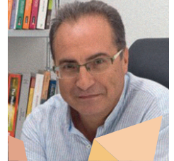
Former President of the International Catalan Institute for Peace