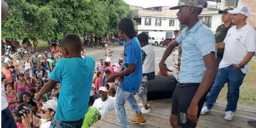
A dance performance for the Palmira tu Voz es Paz project

P almira is a city in western Colombia, known for its sugarcane cultivation. Unfortunately, it is also known as one of the most dangerous cities in the country, due to poverty, high crime rates and much violence. While better policing is meant to fight crime, targeted community interventions are necessary to prevent the city's youth from getting trapped into a life of crime and violence in the first place. A young project called Palmira tu Voz es Paz ('Palmira your Voice is Peace), uses the power of music to achieve this.