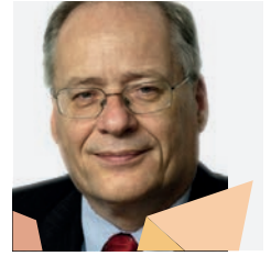
Former Mayor of The Hague, former chair of the UCLG Committee on City Diplomacy

As the former mayor of The Hague Mr. Deetman has been instrumental in positioning the city in the international peace and security domain leading to the International Criminal Court being situated in The Hague. Mr. Deetman was a member of the Dutch Lower House and later held his position of Minister of Education during three consecutive cabinets after which he returned to the Lower House to become its president for a period of seven years. He then became Mayor of The Hague from 1996 to 2008. Wim Deetman is currently a distinguished member of the Dutch Council of State and chairperson of the Kloosterkerk church in The Hague. The Wim Deetman Foundation has been established in his name providing students from developing countries the chance to pursue a master's degree in the area of peace and justice in The Hague.