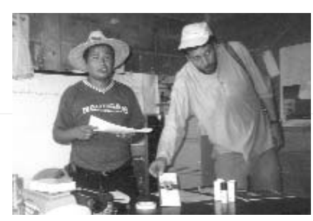
"The mayor of Nimlahakok, a small town in Guatemala, explains to a delegation from Nimlahakok's twin town of Herent, Belgium, how he generally deals with questions posed by local people. "

An analysis of MIC practice in Flanders in 2002-2003 shows that municipalities tend to work in a very traditional project mode, moving from one problem field to the other. Although they work in partnership with Southern municipalities, links with any local development strategy are weak. Equally, a