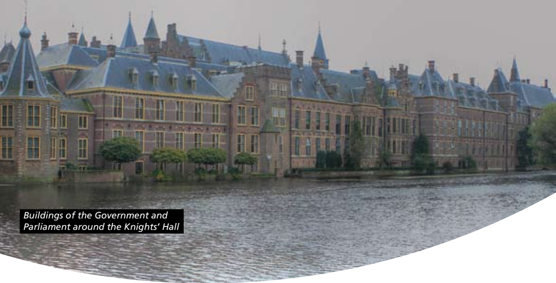
Buildings of the Government and Parliament around the Knights' Hall

When it comes to state organisation, the Netherlands shows two faces. One is the constitutional monarchy saying the Netherlands is a kingdom with a constitution. The other is the face of a decentralised democratic and unitary entity: whereby the central, provincial and municipal governments cooperate to 'organise' society. Each of the three sectors of government has its own responsibilities, with the central government providing unity through legislation and supervision.