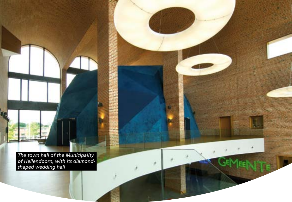
The town hall of the Municipality of Hellendoorn, with its diamond-shaped wedding hall