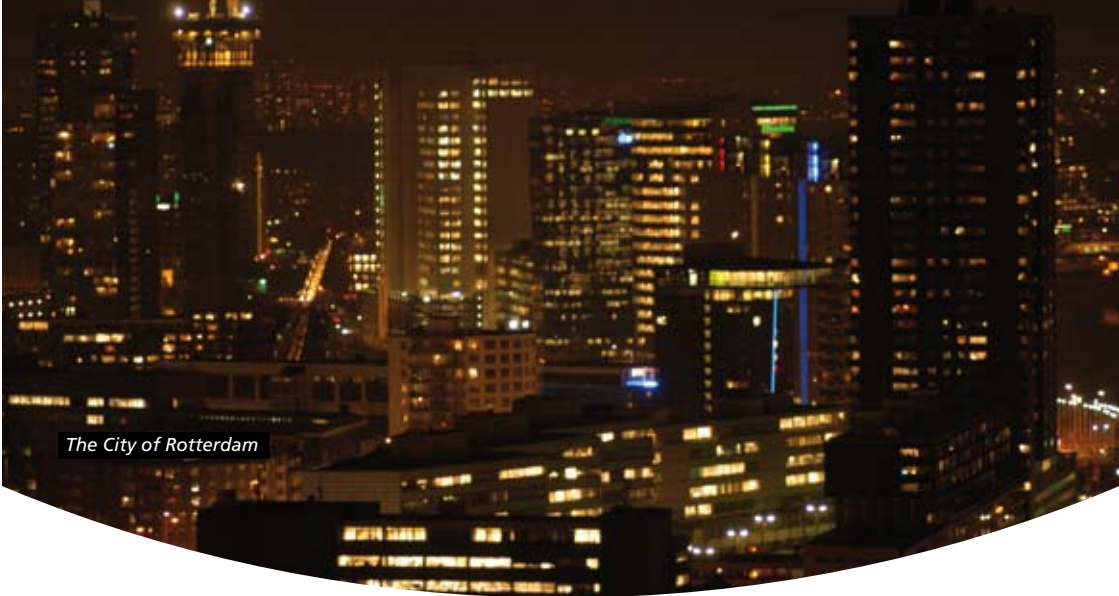
The City of Rotterdam

With some 16.5 million residents on approximately 42,000 square kilometres of inland area (that includes 1600 square kilometres of water where nobody lives), the Netherlands is one of the smaller countries in the world. Small however is relative; much larger countries such as Australia and Chile have a similar number of people. In the Netherlands about 485 people live on each square kilometre which makes it one of the world's most densely populated countries. But anyone travelling through the North, East and parts of the South, hardly notices this. The eye and heart enjoy the strange beauty of the flat countryside, with its church spires in the background, and trees, peacefully grazing cows and