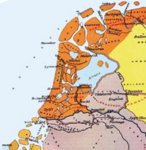
The coastline in the 10th century

and gained shape in the Netherlands. The eternal sword of Damocles of the water threat meant that early residents had to combine and work together to defend themselves, which brought the concepts of rights and obligations to the fore. Agreements affected everyone, and had to be kept to protect the country. As early as the 13th century, some of the oldest of Dutch institutions were created for the maintenance of the dykes. In the 19th century they were replaced by the water boards, which still exist.