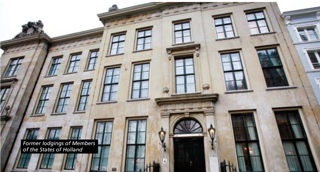
Former lodgings of Members of the States of Holland

In the decentralised unitary state which the Netherlands is today, different tasks are carried out at different levels whereby daily practice involves the three government levels making work agreements. These might cover such tasks as construction of roads, railway lines, houses or general protection and enhancement of the living and working environment. These work agreements ensure municipalities and provinces possess a degree of autonomy. Due to their unique position close to the population, the municipalities over time received an increasingly