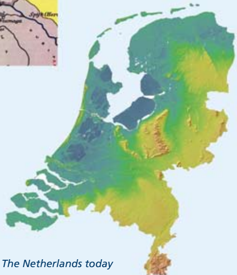
The Netherlands today