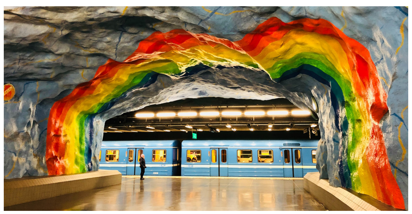
Subway Stockholm.