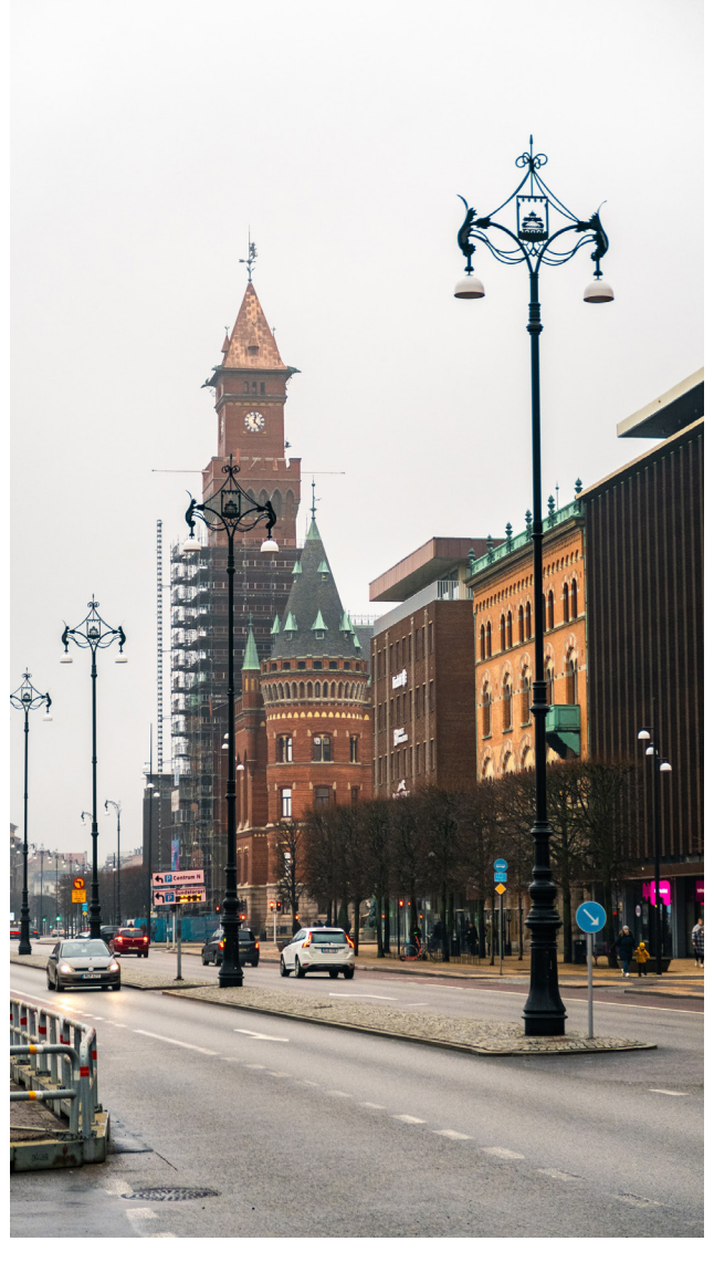
City of Helsingborg.

Local government associations play a fundamental role in raising local voices at the national level – this is especially because they are often crucial institutional gatekeepers that can convey the interests of medium- and small-sized cities, which are of paramount importance in global urbanisation.