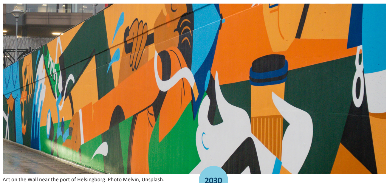
Art on the Wall near the port of Helsingborg.