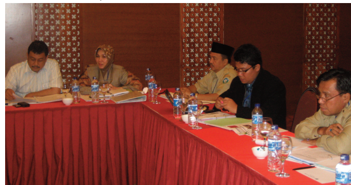
Leaders of districts and cities in the discussion on the Special Autonomy Fund and Shared Earning Fund.

One of the external challenges for the Forum KKA is to reconcile the divide between "GAM & GAM-related" elected officials and elected executive and legislative officials with perceived "nationalist" inclinations. The