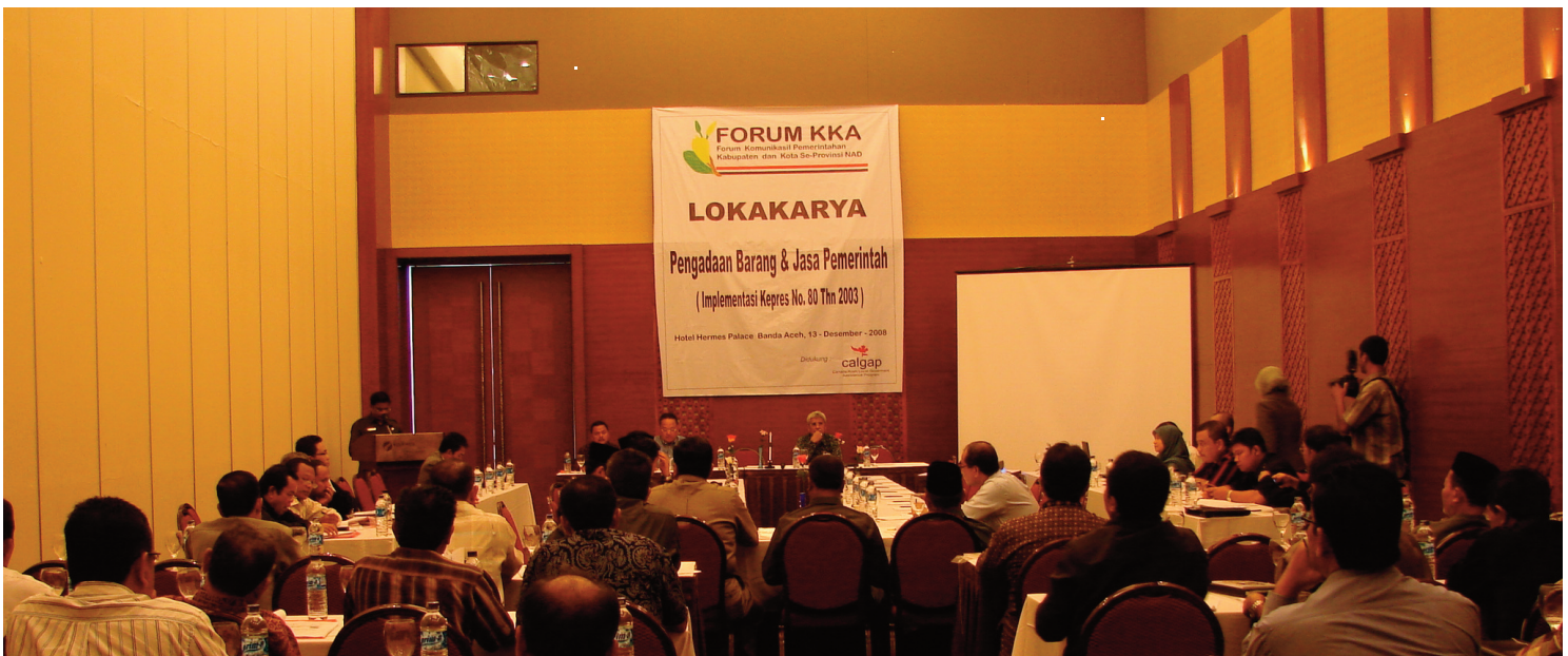
Workshop on Government Procurement Mechanism, mid-December 2008

in selected districts, representing the four regions of Aceh, to understand and compile the perspectives from diversified Forum KKA members. The Forum KKA's Board of Leadership endorsed the findings and recommendations, awareness was raised among Forum members through a series of regional meetings.