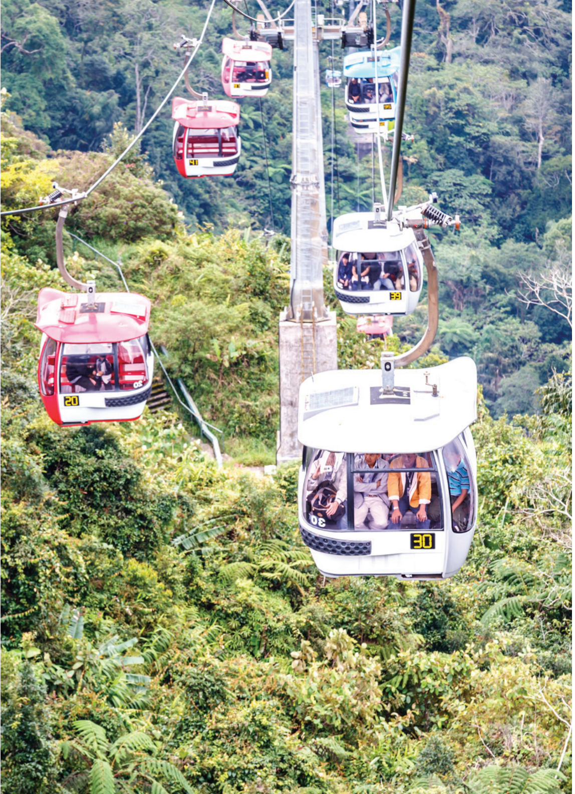
Tourists travel on cable car in Malaysia. It is a gondola lift, connecting Gohitong Jaya and Resorts World Genting.