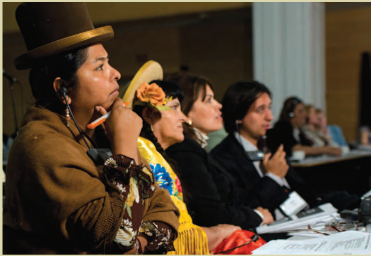
Members of ACOBOL shown participating in FCM's annual conference in Quebec City in 2008, an exchange that enabled the two associations to share knowledge about their respective efforts to increase women's political participation in local government.

producing operational plans through participatory municipal management. Gender equality was an integral dimension of the training through: