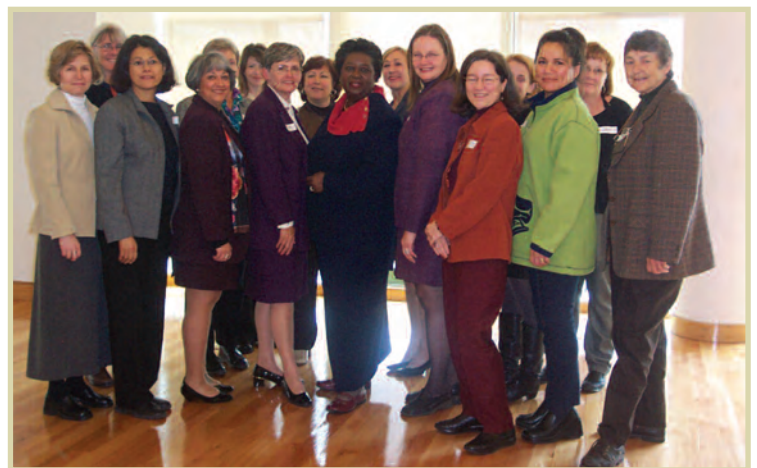
FCM representatives and project stakeholders at launch of the Status of Women Canada-funded project on increasing women's participation in municipal decision-making.

Status of Women Canada (SWC) is a federal government organization that promotes the full participation of women in the economic, social and democratic life of Canada. SWC works to advance equality for women and to remove the barriers to women's participation in society, putting particular emphasis on increasing women's economic security and eliminating violence against women. See http://www.swc-cfc.gc.ca for more information.