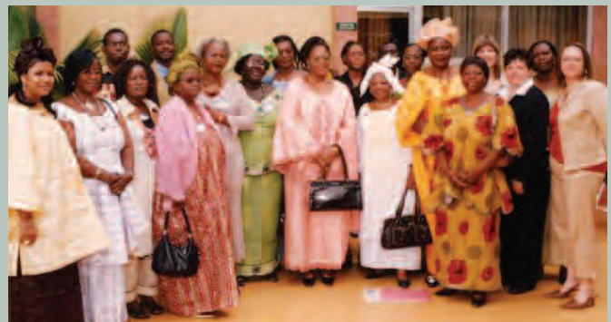
Participants of the first meeting of the African Women in Local Governance Network in Burkina Faso in December 2006.

The African Women in Local Government Network was launched at UN-Habitat's World Urban Forum 3 in Vancouver under the auspices of FCM's African Local Governance Program. The network initially linked women mayors and councillors in Ghana, Mali, Mozambique and Tanzania and eventually expanded to include women from Burkina Faso, whose national local government association hosted the first meeting of the network following the launch. The network also shares knowledge with and provides technical support to women from other African countries actively involved in local governance.