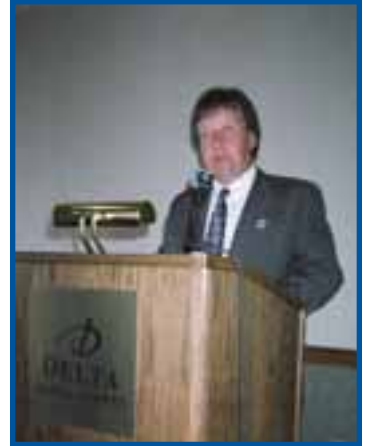
Mayor Clifford Lee, City of Charlottetown. City of Charlottetown Workshop, September 7, 2005.

New Brunswick Energy Minister Bruce Fitch credits Scotia Bank’s support for his decision to become involved in municipal government as a councillor and then as Mayor of Riverview, which led to his role as Minister of Energy and Minister of Justice & Consumer Affairs for the Province of New Brunswick.