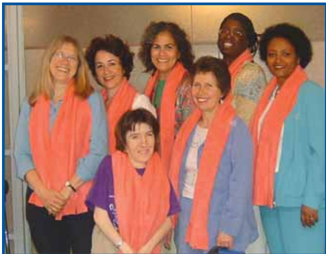
Steering Committee of the City for All Women Initiative. Community women wear peach scarves to be visible when they take their concerns to Ottawa City Council.

“Planning policies influence the lives of women and men in different ways and both perspectives are needed in the planning process. Gender is the most fundamental organising feature of society affecting our lives from the moment we are born. Gender mainstreaming recognises diversity between genders, as well as remembering that gender cuts across other kinds of differences, ethnicity, class, disability and age.”